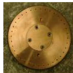
Cooled Pintle Tip