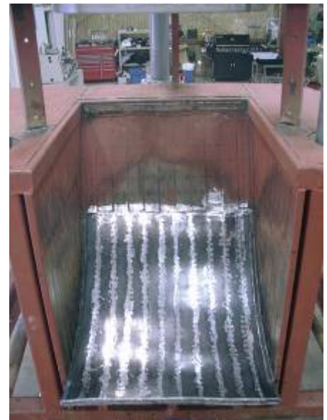
Flame Bucket Reinforced for Long Duration Burns