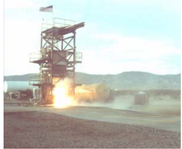
Facility Checkout Test Fire (10 seconds) on Vertical Test Stand (VTS)