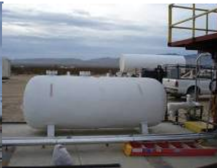
Propane Conditioning Tank