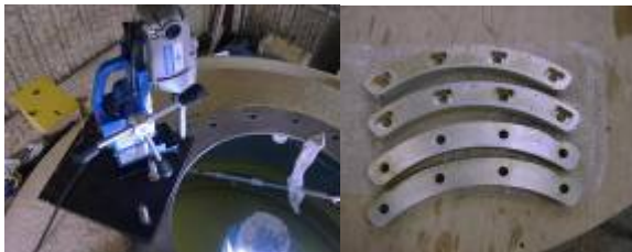
Engine Mounting Segments