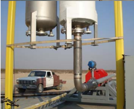
Plumbing in Place in the Propellant Lines on Horizontal Test Stand (HTS)