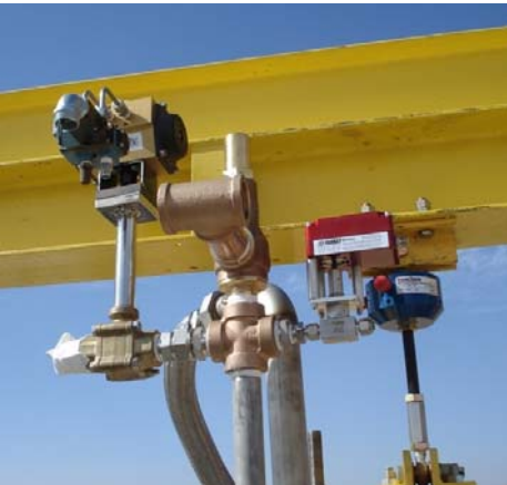
LOX Vent Stack and Valves