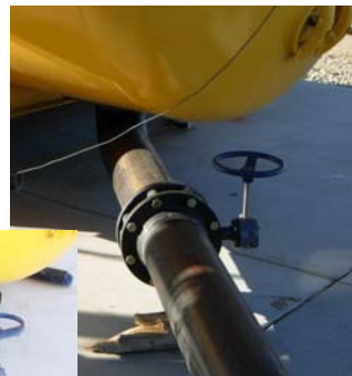
Water Tank Valve