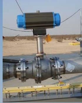
HTS Actuated Valve