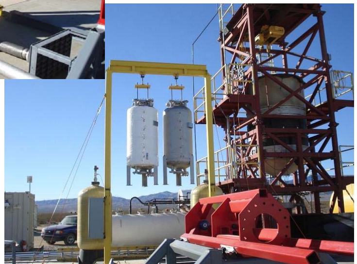
Tanks in Place